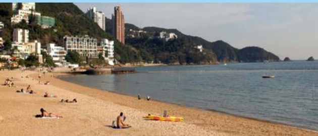
The improved Repulse Bay offers respite from busy city life